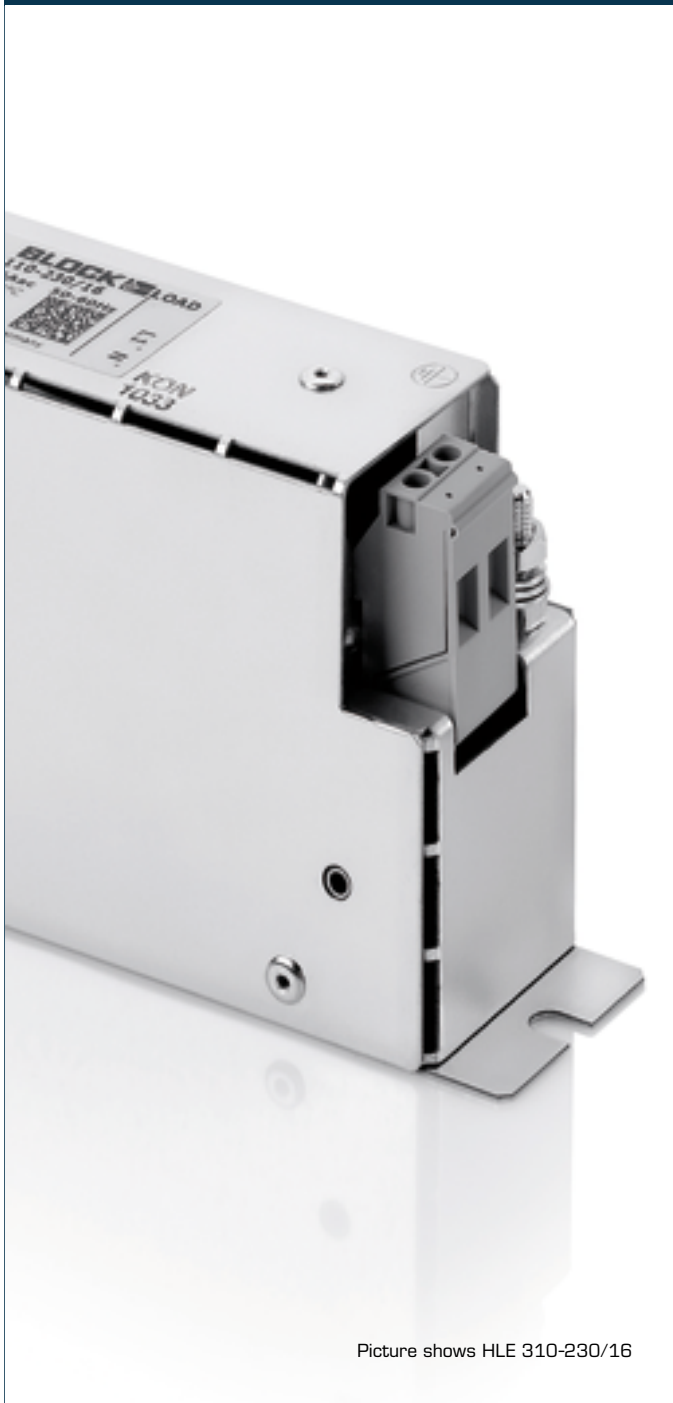
Picture shows HLE 310-230/16